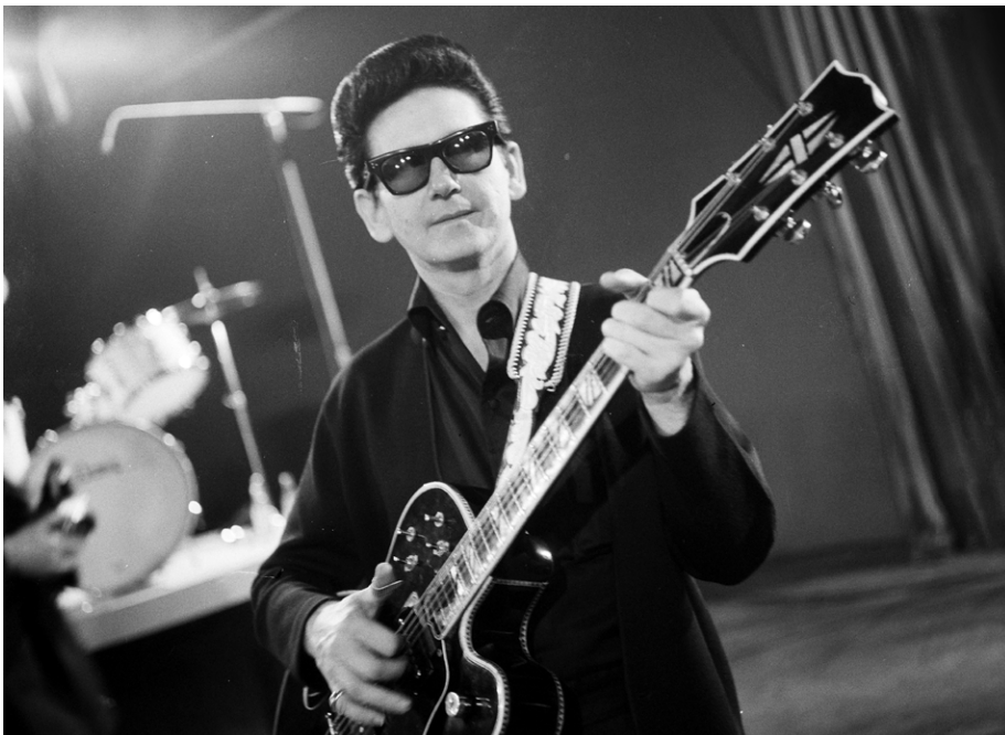
Roy Orbison in 1965.