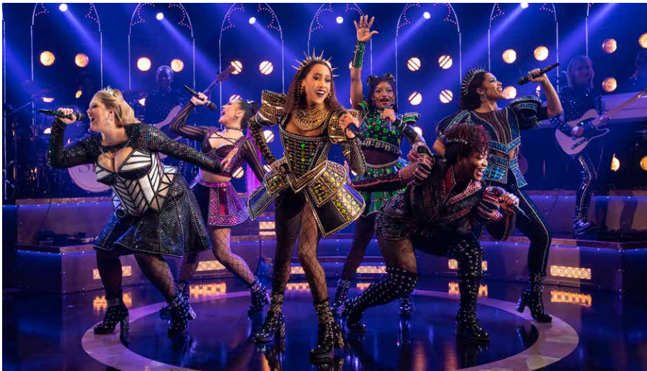
Photo of Broadway cast.