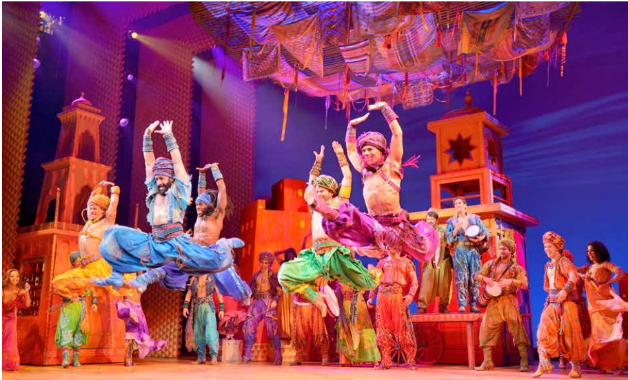
Arabian Nights Men. Aladdin on Broadway.