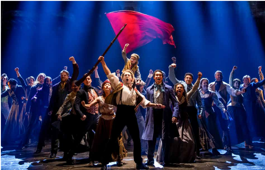
“One Day More” from Les Misérables.